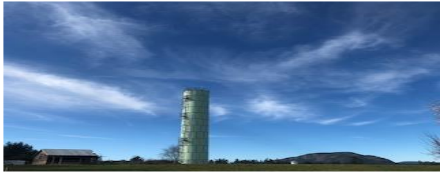
Telegraph Reservoir 195,000 imperial gallons