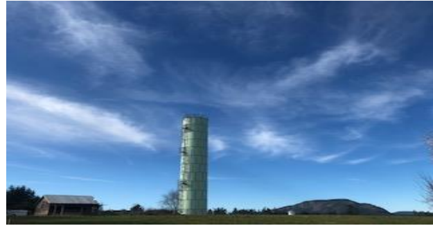
Telegraph Reservoir 195,000 imperial gallons