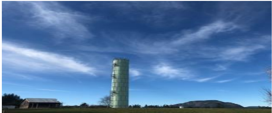
Telegraph Reservoir 195,000 imperial gallons