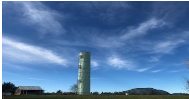
Telegraph Reservoir 195,000 imperial gallons